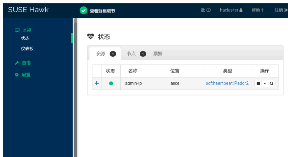
图 1：HAWK2 中单节点群集的状态